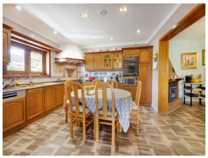
Contry style kitchen