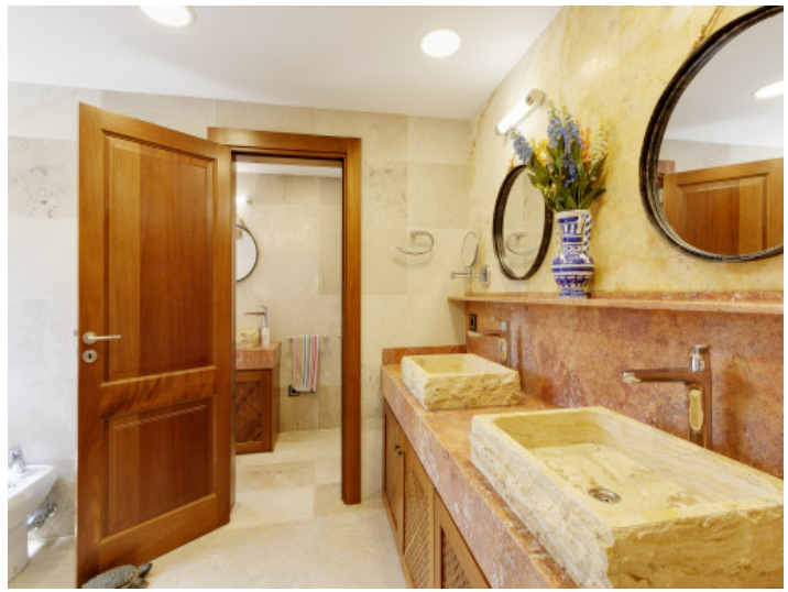
Finca with 5 bathrooms