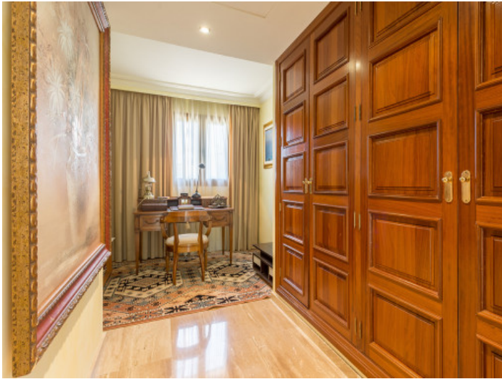
Further office corner with roomy fitted wardrobes