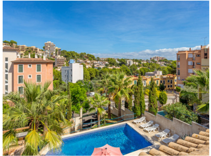
Views to the beautiful pool area