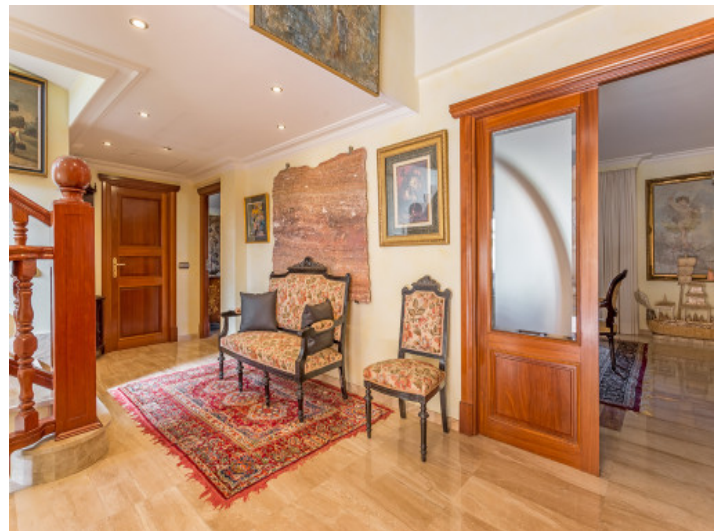
The generous house was built in 2004