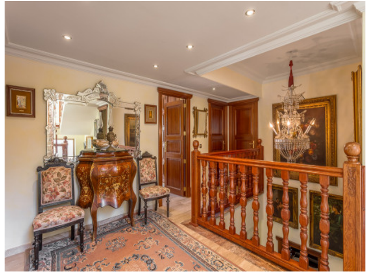
Open gallery on the upper floor