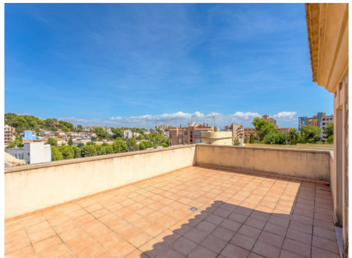
The large roof terrace offers views to the surroundings

All information is correct to the best of our knowledge. Errors and prior sale excepted. This prospectus is purely for information purposes. Only the notarized deed of sale is legally binding.