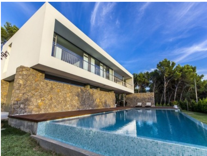
According to the latest energy standards