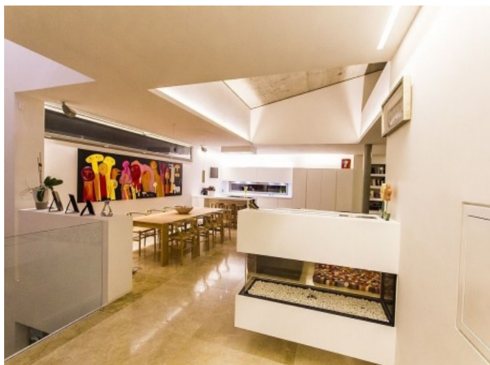
Inviting dining area on the first floor