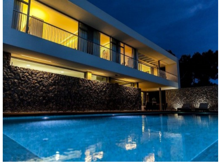
Illumination by night