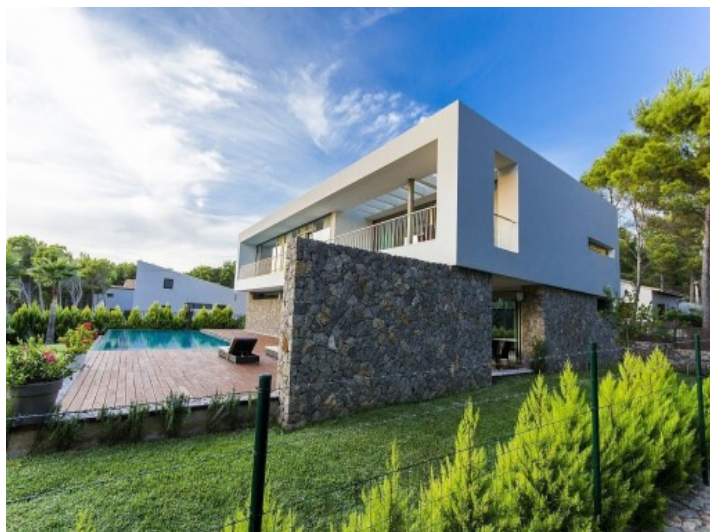
Well-tended garden with inviting pool area