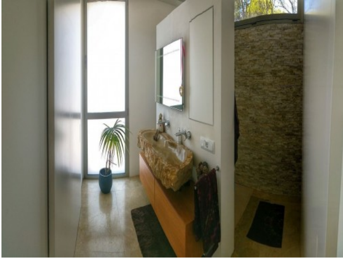
One of two bathrooms with designer washbasin