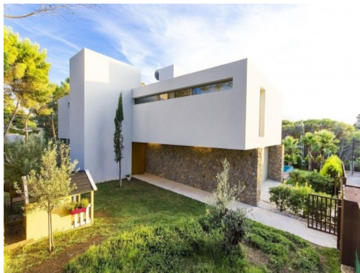
Exterior view of the villa with natural stone elements