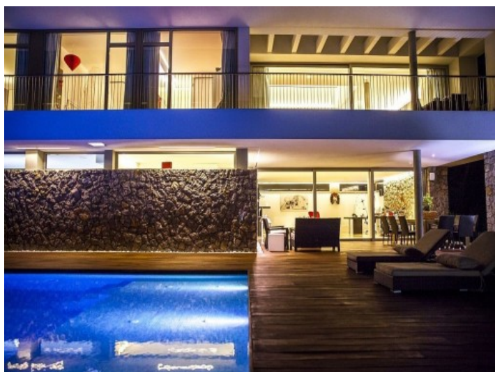
Very exclusive villa with special illumination