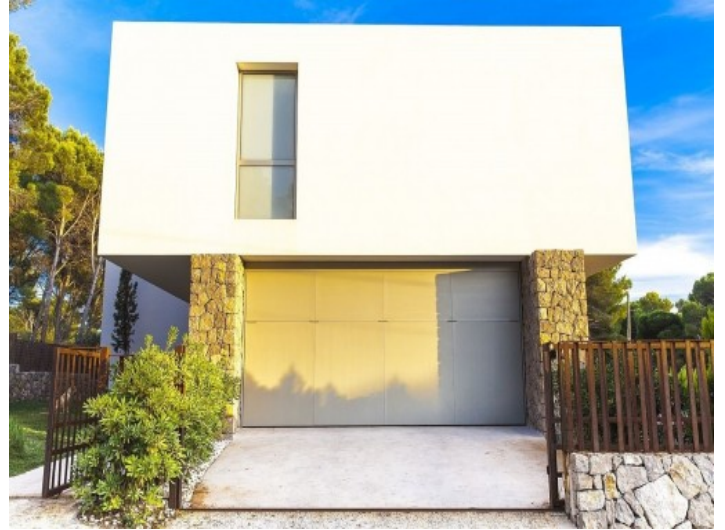
Access to the garage