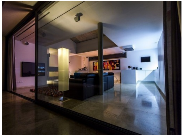
Stylish living area

All information is correct to the best of our knowledge. Errors and prior sale excepted. This prospectus is purely for information purposes. Only the notarized deed of sale is legally binding.