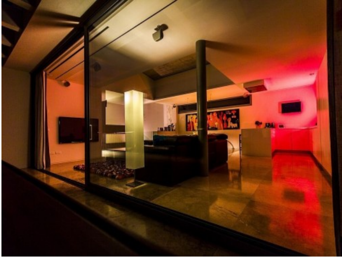
Nice light installation in the living room