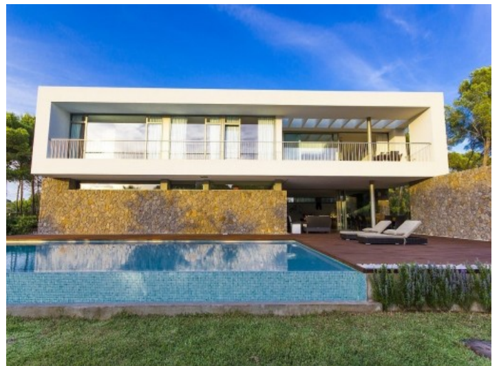
Terrasse beside the pool with lounge area

All information is correct to the best of our knowledge. Errors and prior sale excepted. This prospectus is purely for information purposes. Only the notarized deed of sale is legally binding.