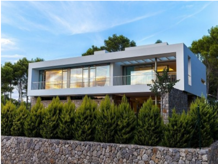
Exterior view of the house with privacy