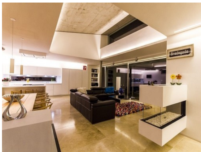
Open living and dining area with kitchen