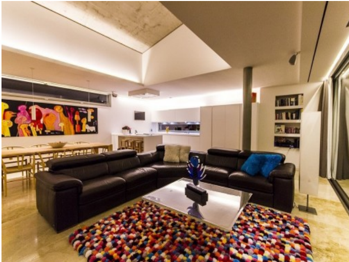
Alternative view of the living area