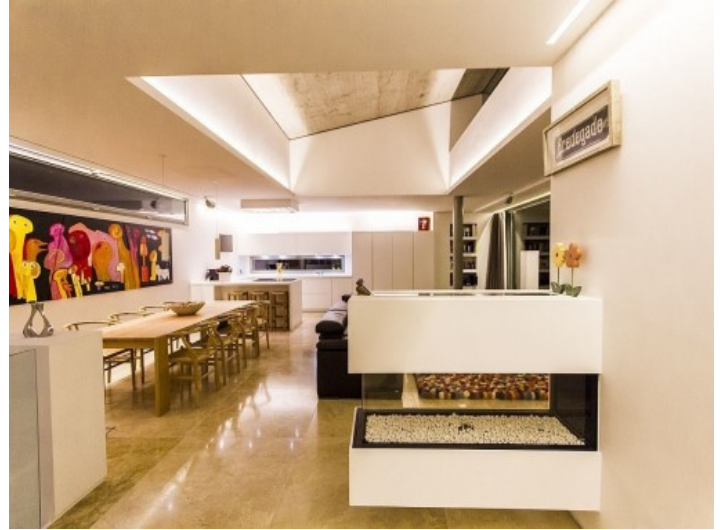
Bright dining area with fireplace