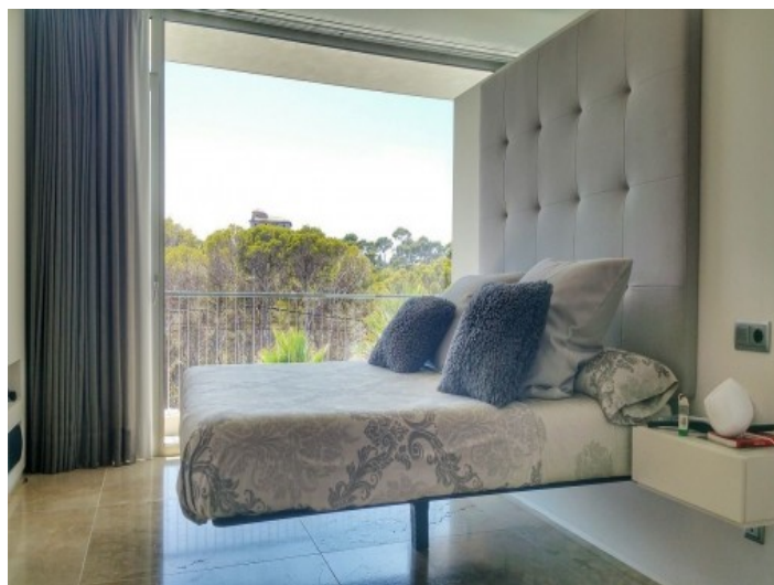
One of three bedrooms with views of the surrounding

All information is correct to the best of our knowledge. Errors and prior sale excepted. This prospectus is purely for information purposes. Only the notarized deed of sale is legally binding.