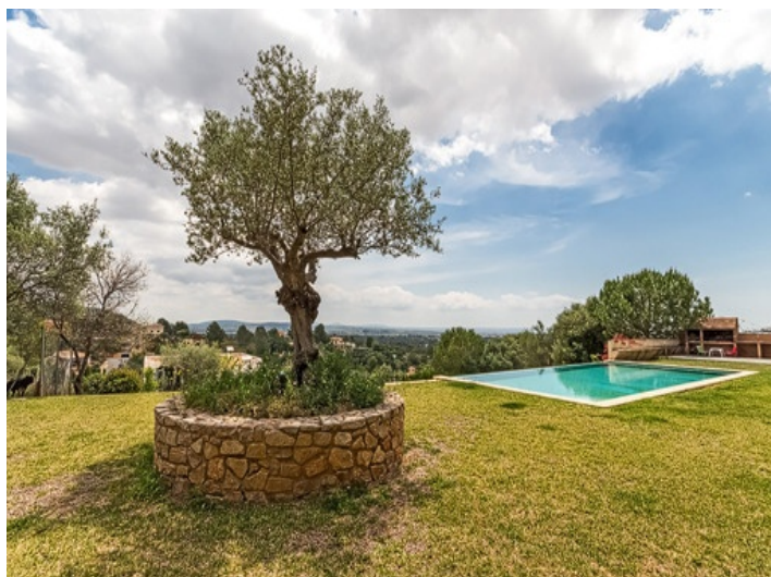
Well-tended garden with pool area