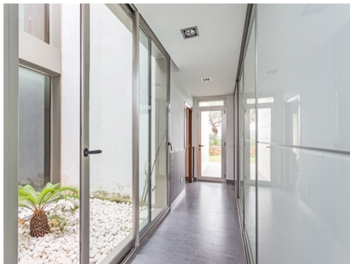
Corridor with panoramic windows on the ground floor