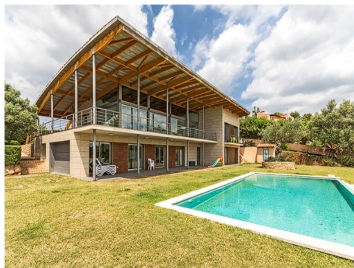
Exterior view of the luxury villa