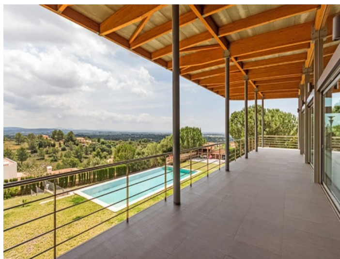
Covered terrace with panoramic views