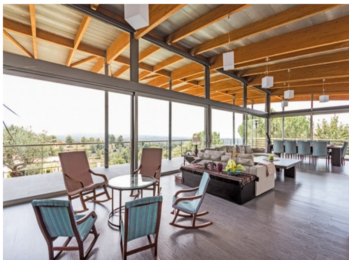
Light-flooded living and dining area with panoramic windows