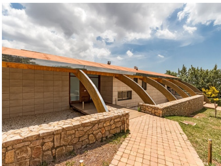
Interestingly designed entrance