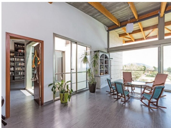
Living area beside the kitchen