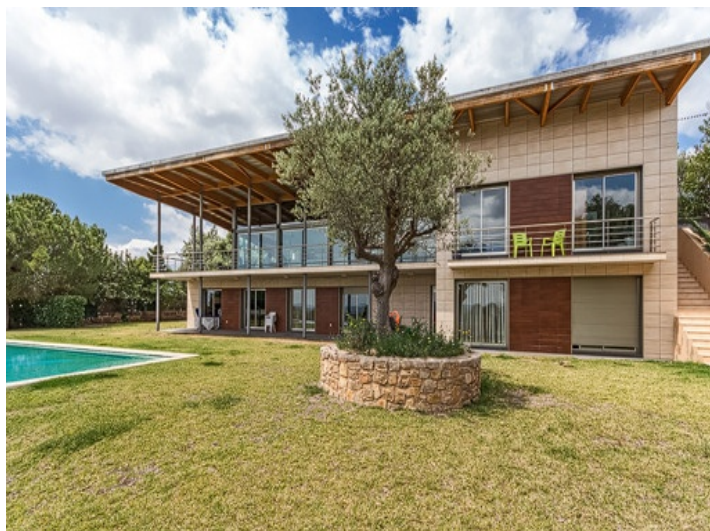
Located on the top of a hill