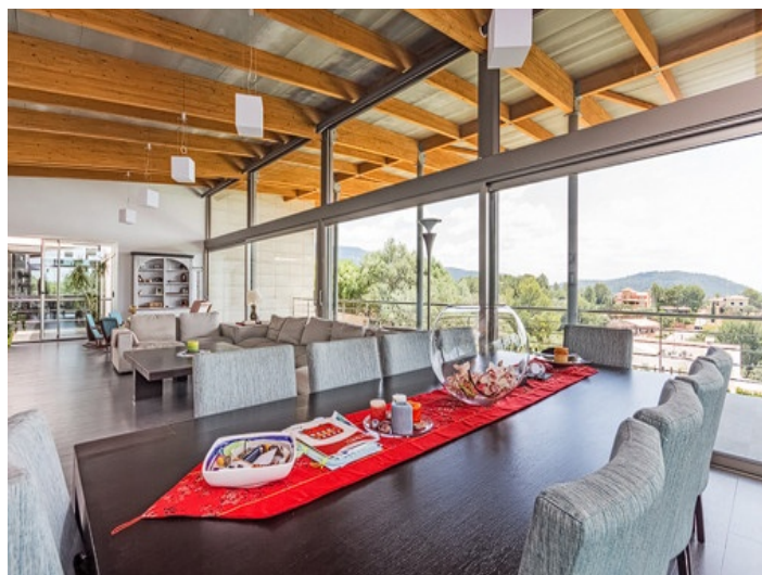
Open dining and living area with fantastic views

All information is correct to the best of our knowledge. Errors and prior sale excepted. This prospectus is purely for information purposes. Only the notarized deed of sale is legally binding.