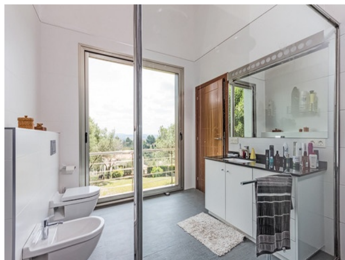
Master bathroom with large windows