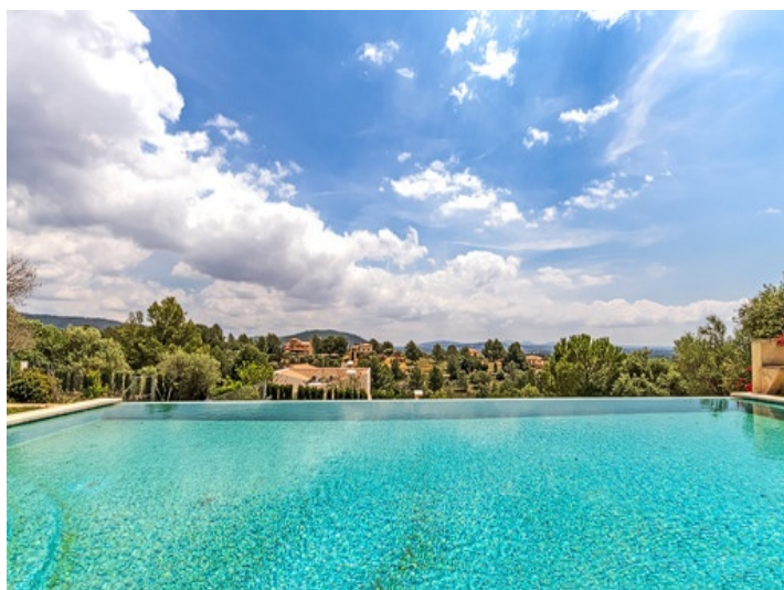
Impressive views from the pool