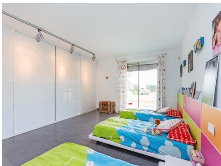
Spacious bedroom with built-in wardrobe