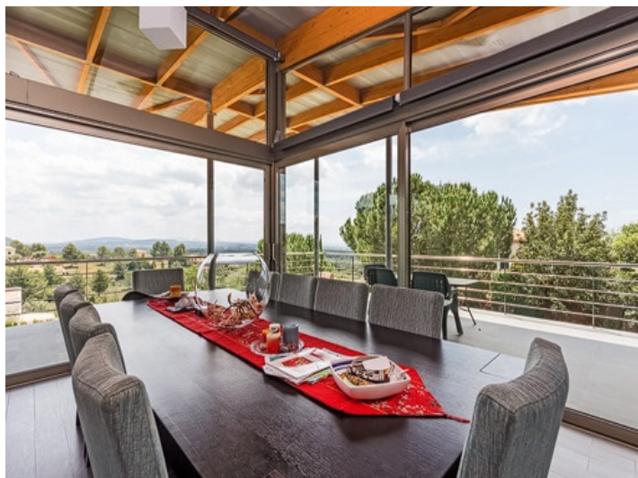
Inviting dining area with spectacular views of the surrounding