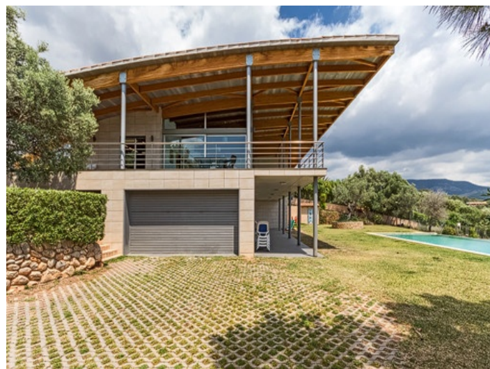
Access to the garage

All information is correct to the best of our knowledge. Errors and prior sale excepted. This prospectus is purely for information purposes. Only the notarized deed of sale is legally binding.