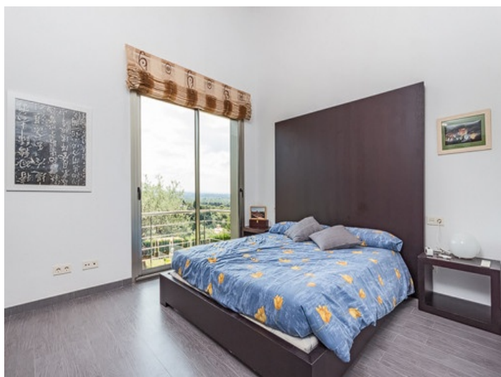
Bright master bedroom