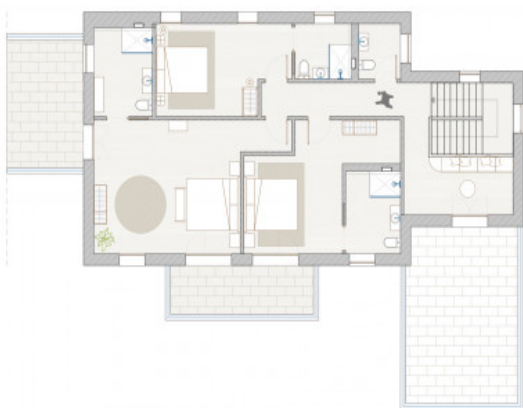
FIRST FLOOR PLAN E.175