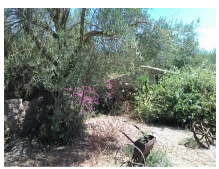
All information is correct to the best of our knowledge. Errors and prior sale excepted. This prospectus is purely for information purposes. Only the notarized deed of sale is legally binding.