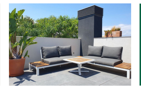
Portixol Referens 122111