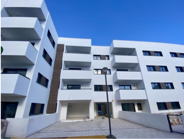
Planta Calle Estadio 8, 12 CALA RATJADA, 1 W. CONQUESTOR