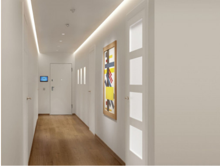
133.4 m 2 Apartment in Santa Catalina, Palma, Mallorca