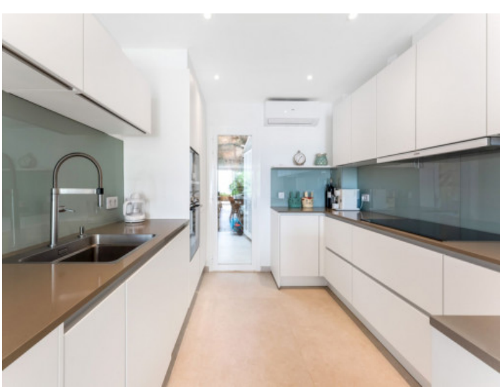
All information is correct to the best of our knowledge. Errors and prior sale excepted. This prospectus is purely for information purposes. Only the notarized deed of sale is legally binding.