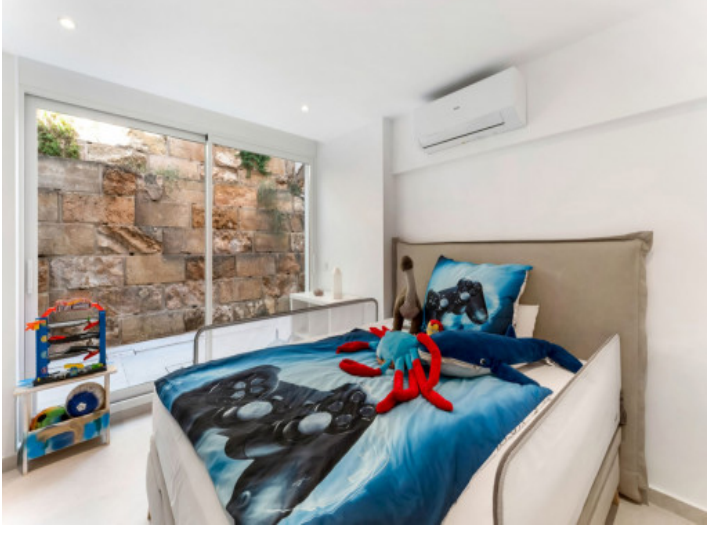
All information is correct to the best of our knowledge. Errors and prior sale excepted. This prospectus is purely for information purposes. Only the notarized deed of sale is legally binding.