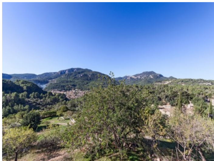
Wonderful views of the Tramuntana

All information is correct to the best of our knowledge. Errors and prior sale excepted. This prospectus is purely for information purposes. Only the notarized deed of sale is legally binding.