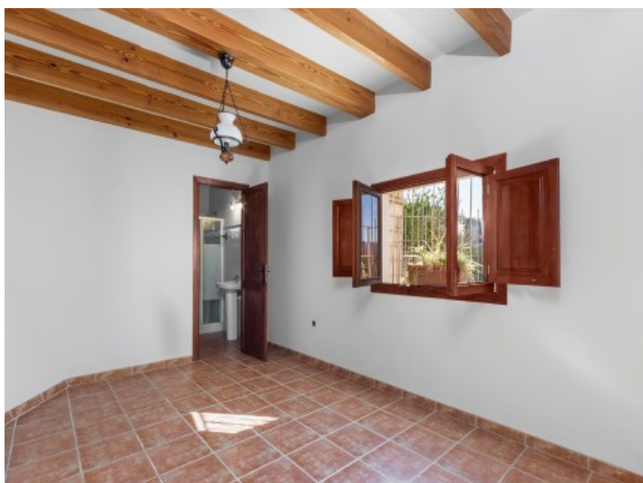
Access from the bedroom to the bathroom