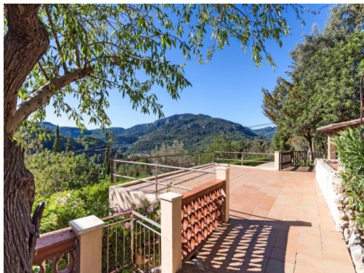
Sunny terrace with great landscape views