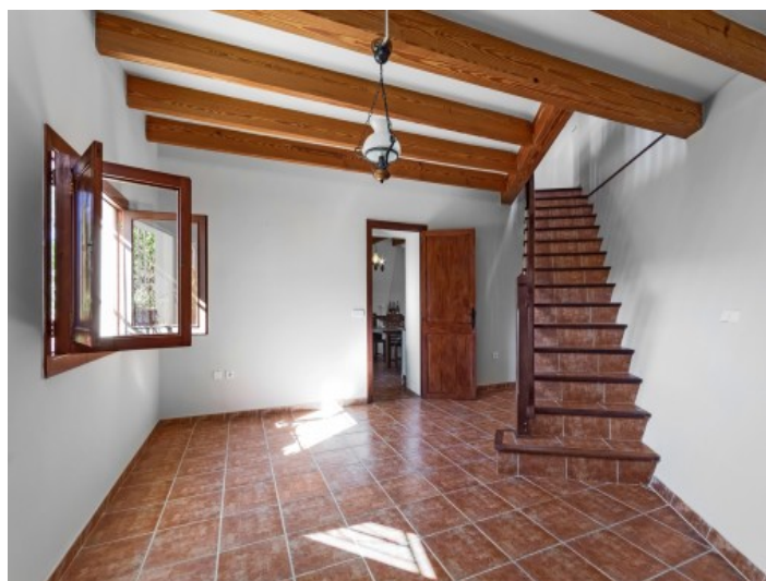
The guest house has 2 storeys