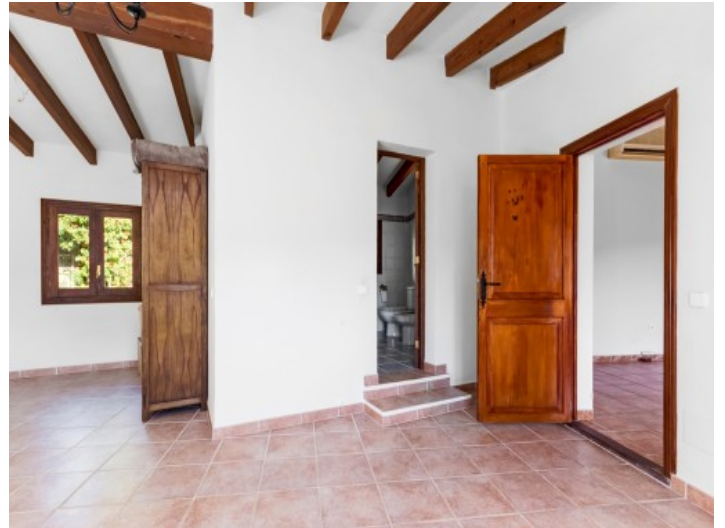
Main bedroom with bathroom en suite