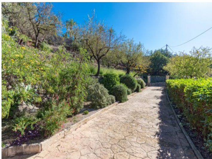
Driveway to the finca