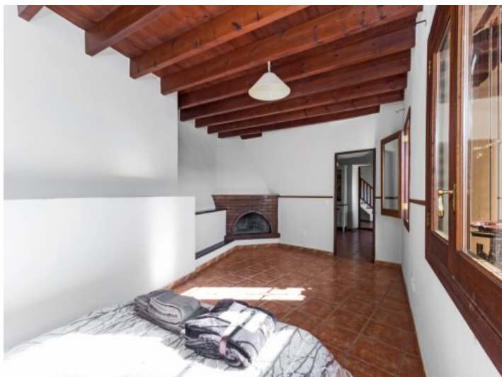
Guest bedroom with fireplace