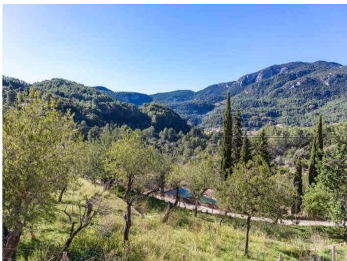
The finca is surrounded by nature