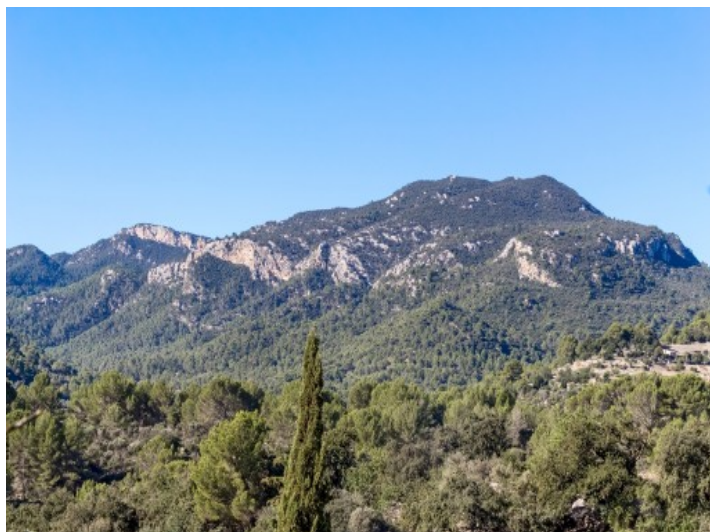
Breath-taking mountain views