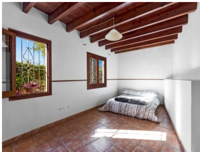
Typical roof beams