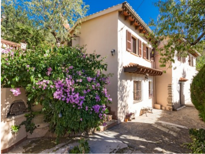
Exterior views of the main house