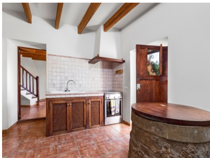
Rustic kitchen in the guest house