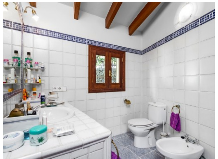
Mediterranean master bathroom

All information is correct to the best of our knowledge. Errors and prior sale excepted. This prospectus is purely for information purposes. Only the notarized deed of sale is legally binding.