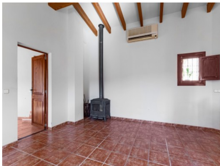
Fireplace in the guest house

All information is correct to the best of our knowledge. Errors and prior sale excepted. This prospectus is purely for information purposes. Only the notarized deed of sale is legally binding.