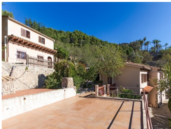
Views of the terrace, the guest and the main house

All information is correct to the best of our knowledge. Errors and prior sale excepted. This prospectus is purely for information purposes. Only the notarized deed of sale is legally binding.