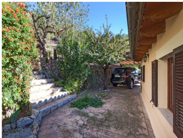
Parking and entrance area