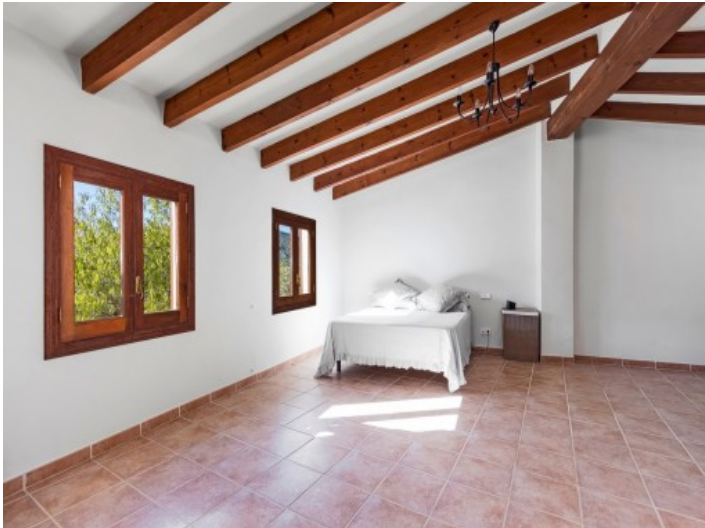
Extensive master bedroom