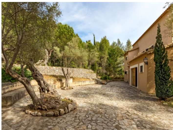
Access to the finca