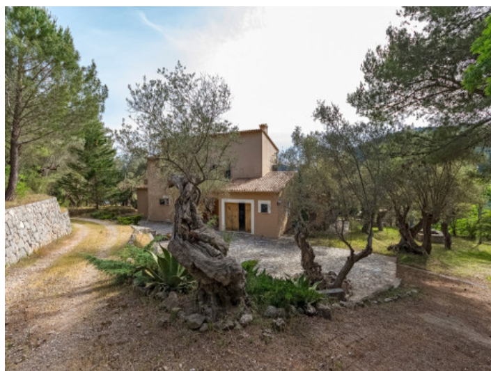
Exterior view and outdoor area