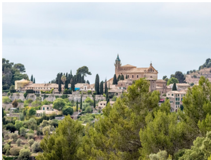
View to Valldemossa