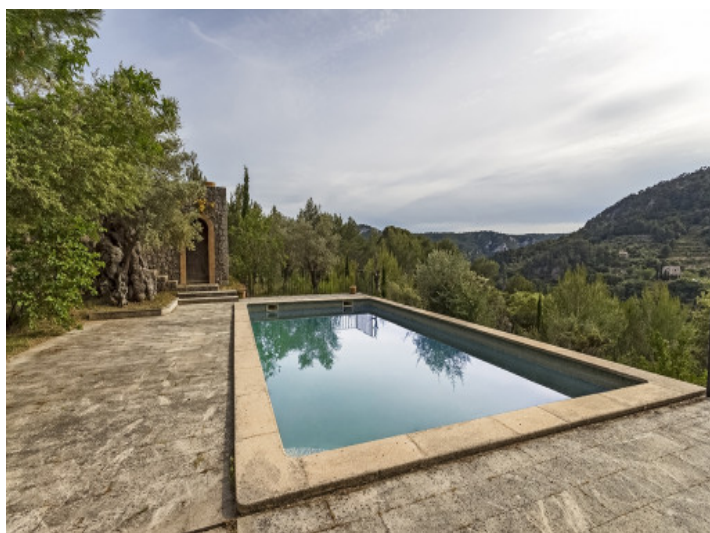
Pool with a view