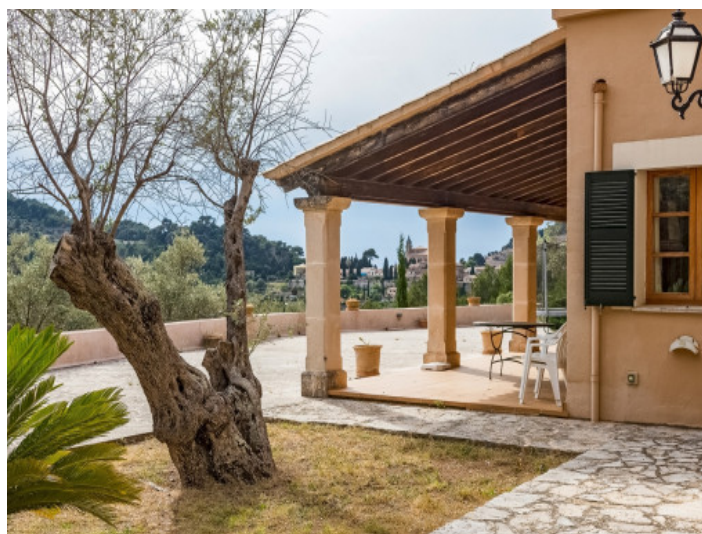
Terrace and view to Valldemossa