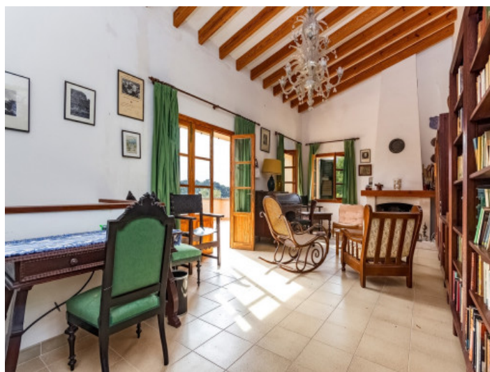
Rustic living area with fireplace