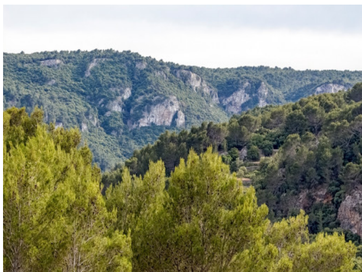
View to the Tramuntana