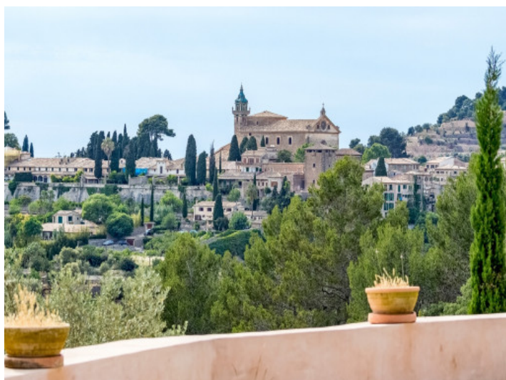
View to Valldemossa